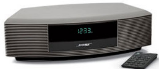
Bose Wave Radio III $349.95