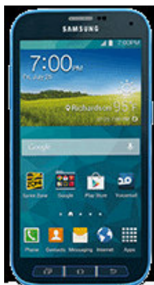
Samsung Galaxy S5 Sport