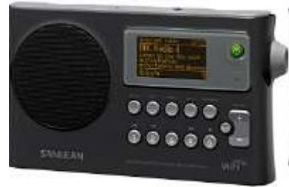
Sangean Internet Radio Model#: WFR-28 $137.99