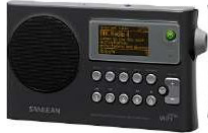
Sangean Internet Radio Model#: WFR-28 $137.99