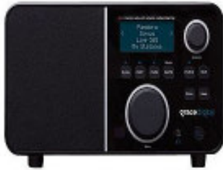
Grace Digital Innovator X WiFi Internet Radio $106.49