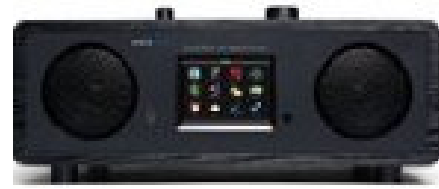
Grace GDI-IRC7500 internet radio $199.99