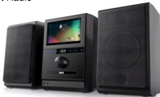
This RCA WiFi Internet stereo radio is available in most Walmart stores for $149.95. It has two separate stereo speakers.