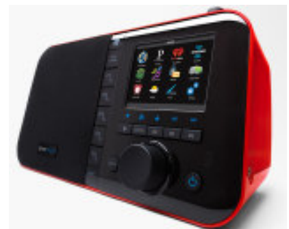
Grace "Mondo" internet radio $146.74