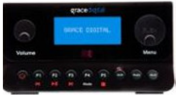
Grace internet radio $95.22